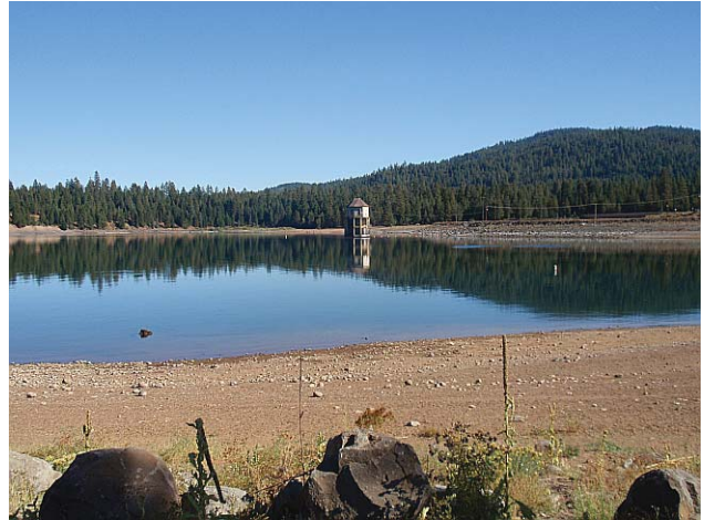
Photo 13a, VAU CDBL, KOP 1. View looking south toward Canyon dam intake/spillway from the Canyon Dam Boat Launch parking lot.