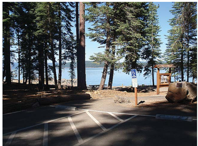
Photo 3, VAU MA, KOP 3. View of the Prattville intake from the Marvin Alexander Day Use Area parking lot.

R:\Projects\26100 UNFFR Hydroelectric\EIR\Admin Draft 11/09 sgc