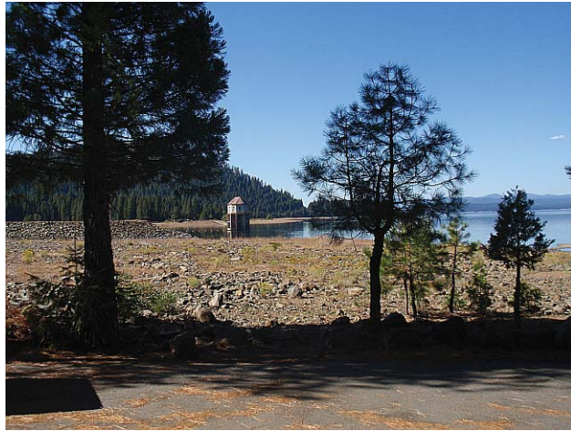
Photo 10b, VAU CDPA, KOP 2. View looking west toward the Canyon dam intake and spillway from the Canyon Dam Picnic Area parking lot.