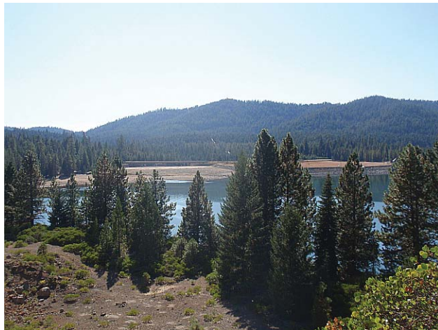
Photo 11a, VAU CoRD147, KOP 1. View of Lake Almanor looking west toward Canyon dam from scenic overlook on County Road 147.