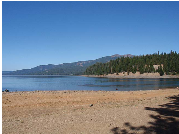
Photo 9c, VAU CDPA, KOP 1. View of Lake Almanor looking northeast from the Canyon Dam Picnic Area waterfront.