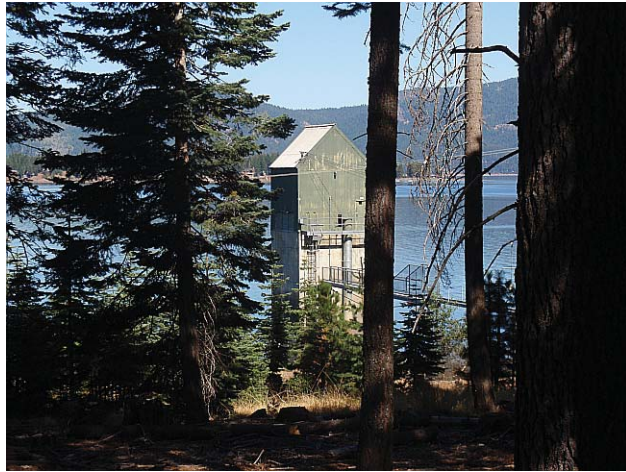
Photo 4, VAU NAEF, KOP 1. View of Prattville intake from driveway entrance to the Doug Naef building at its intersection with Almanor Drive West.