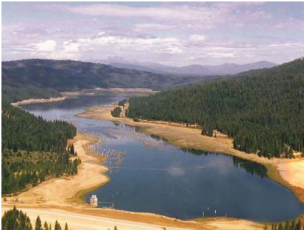
Photo 16, VAU BV, KOP 3. View of Butt Valley reservoir looking north.