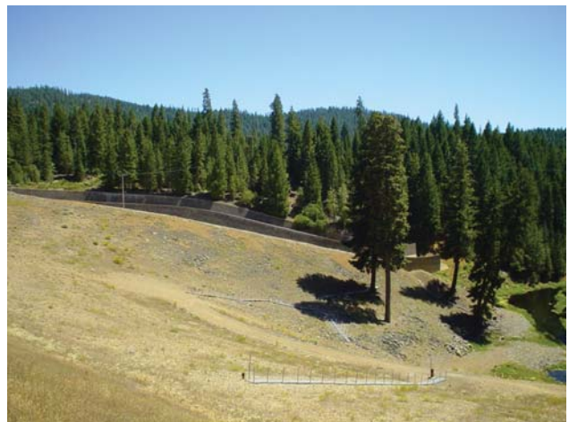
Photo 8c, VAU SR89, KOP 2. View of Canyon dam spillway from State Route 89 southbound.

R:\Projects\26100 UNFFR Hydroelectric\EIR\Admin Draft 11/09 sgc