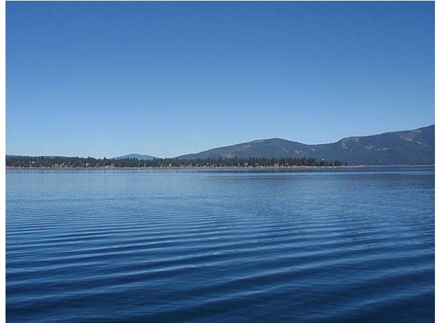
Photo 2b, VAU MA, KOP 2. View of Lake Almanor looking east/northeast (toward Lake Almanor Country Club) from the Marvin Alexander Day Use Area jetty.