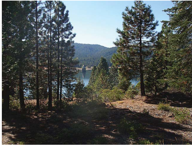
Photo 12, VAU CoRD147, KOP 2. View of Lake Almanor looking west toward Canyon dam from southbound lane of County Road 147.