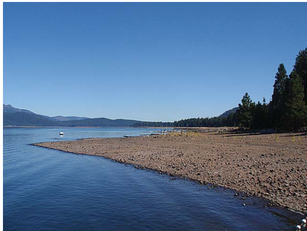
Photo 2c, VAU MA, KOP 2. View of Lake Almanor looking southeast from the Marvin Alexander Day Use Area jetty.