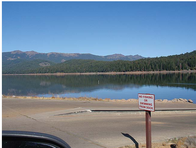
Photo 13b, VAU CDBL, KOP 1. View looking east toward Canyon dam intake/spillway from the Canyon Dam Boat Launch parking lot.