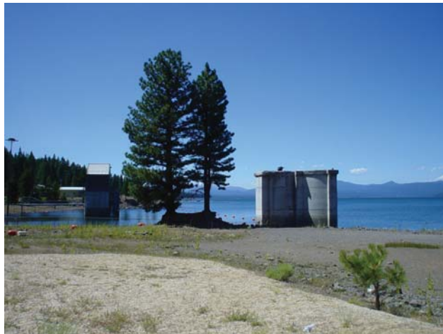
Photo 1c, VAU MA, KOP 1. Prattville intake as seen from the Marvin Alexander Day Use Area.