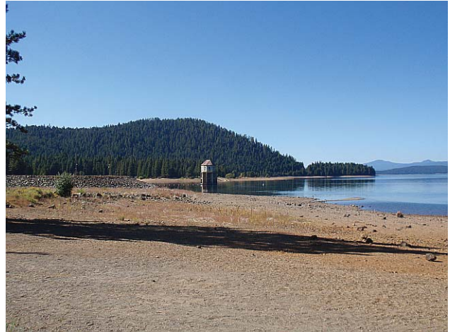
Photo 9b, VAU CDPA, KOP 1. View looking west toward Canyon dam intake and spillway from the Canyon Dam Picnic Area waterfront.