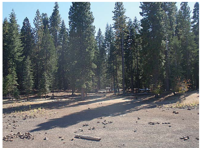
Photo 1d, VAU MA, KOP 1. The Marvin Alexander Day Use Area as seen from the waterfront.