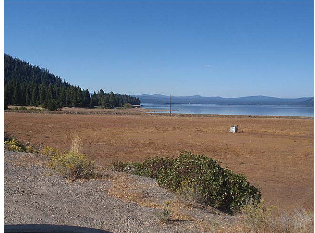
Photo 8a, VAU SR89, KOP 2. View of the Canyon dam intake from State Route 89 northbound.