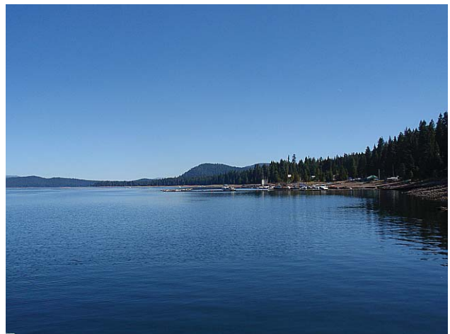
Photo 6b, VAU PP, KOP 2. View of Lake Almanor looking southeast toward the Prattville intake from Plumas Pines Resort boat dock.

R:\Projects\26100 UNFFR Hydroelectric\EIR\Admin Draft 11/09 sgc