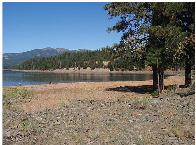
Photo 10a, VAU CDPA, KOP 2. View of Lake Almanor looking northeast from the Canyon Dam Picnic Area parking lot.