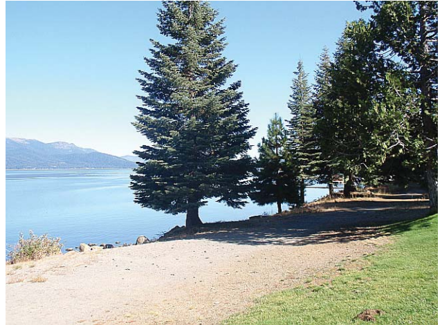
Photo 5, VAU PP, KOP 1. View looking southeast toward the Prattville intake from the lawn of Plumas Pines Resort restaurant.