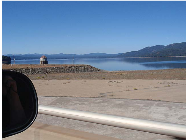
Photo 7, VAU SR89, KOP 1. View of the Canyon dam intake/spillway from State Route 89 northbound.