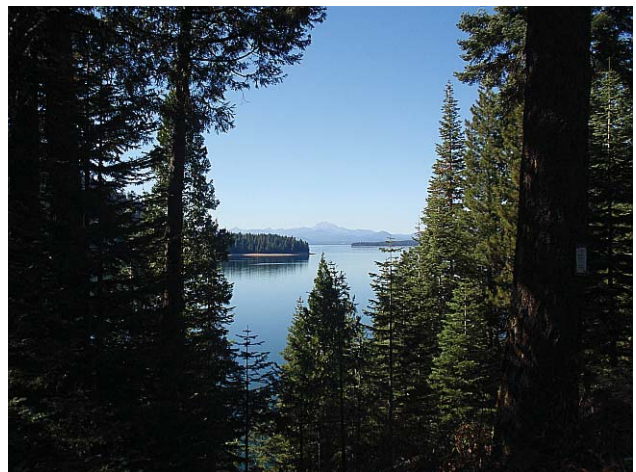
Photo 11b, VAU CoRD147, KOP 1. View of Lake Almanor looking northwest toward Canyon dam from scenic overlook on County Road 147.

R:\Projects\26100 UNFFR Hydroelectric\EIR\Admin Draft 11/09 sgc