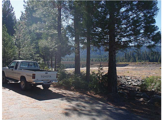
Photo 10c, VAU CDPA, KOP 2. View looking west toward the Canyon dam intake and spillway from the Canyon Dam Picnic Area parking lot.