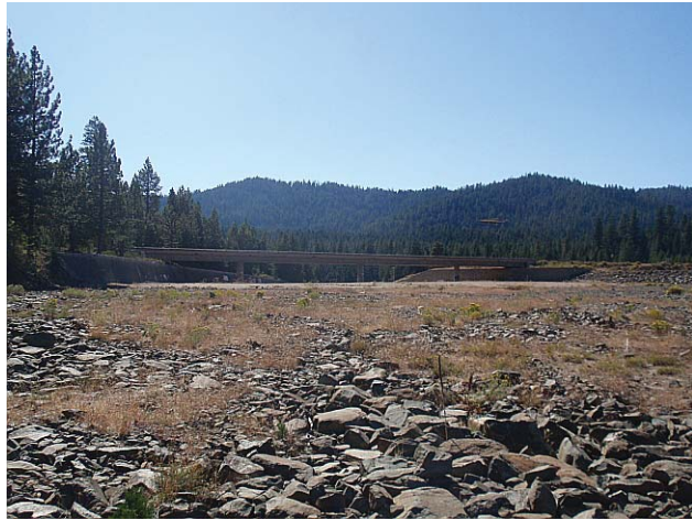
Photo 9a, VAU CDPA, KOP 1. View looking toward the Canyon dam spillway/State Route 89 from the Canyon Dam Picnic Area waterfront.