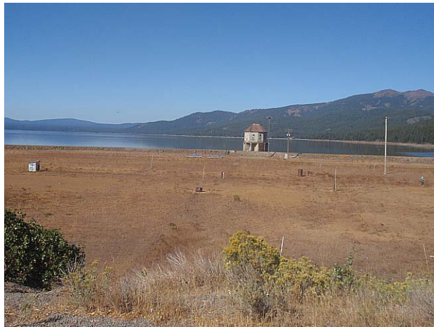
Photo 8b, VAU SR89, KOP 2. View of the Canyon dam intake from State Route 89 southbound.