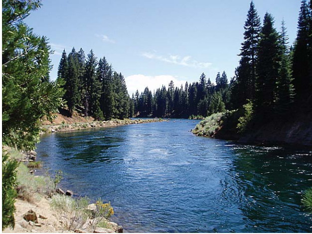
Photo 14, VAU BV, KOP 1. View looking downstream towards Butt Valley reservoir below Butt Valley powerhouse.