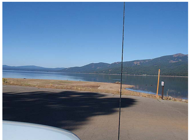
Photo 13c, VAU CDBL, KOP 1. View looking north toward Canyon dam intake/spillway from the Canyon Dam Boat Launch parking lot.

R:\Projects\26100 UNFFR Hydroelectric\EIR\Admin Draft 11/09 sgc