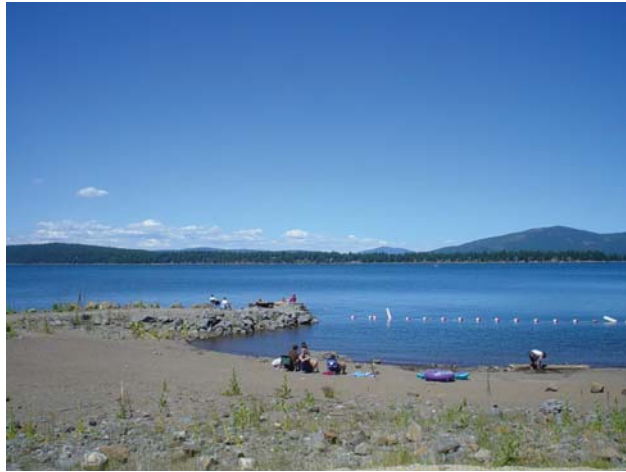
Photo 1a, VAU MA, KOP 1. View of Lake Almanor looking east from Marvin Alexander Beach.