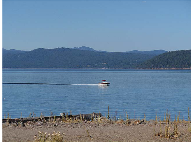
Photo 1b, VAU MA, KOP 1. View of Lake Almanor looking north from the Marvin Alexander Day Use Area waterfront.