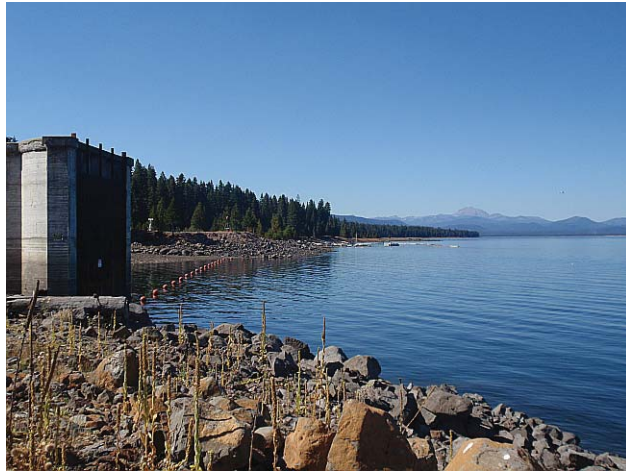
Photo 2a, VAU MA, KOP 2. Prattville intake as seen from Marvin Alexander Day Use Area jetty. Mount Lassen is in the background.