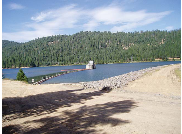
Photo 15, VAU BV, KOP 2. View of Butt Valley reservoir from Butt Valley dam.