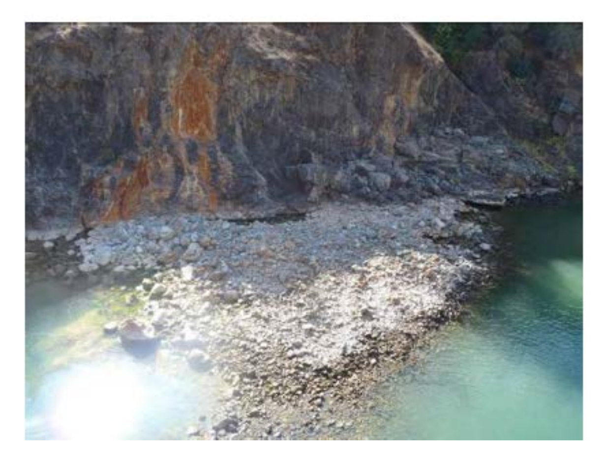
Figure 2: Gravel Bar Adjacent to Narrows 2 Powerhouse