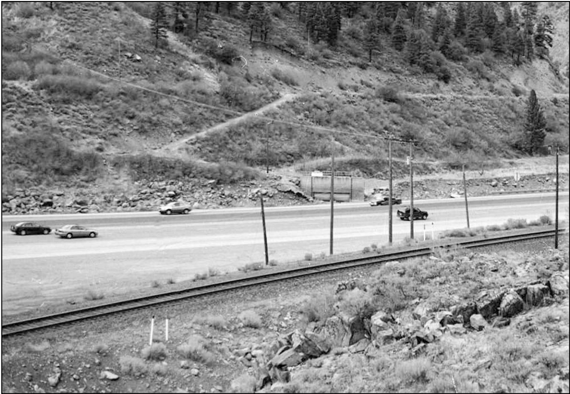
View looking northwest at the old diversion structure, access road, and proposed construction staging area.