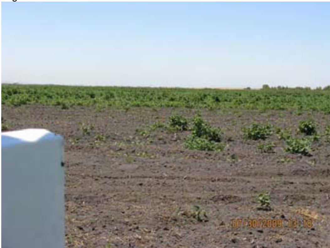
SR1 looking west 7/30/09

– The permanent SR station, SR1, is located in Field 23. The field continues to have slow growth of vegetation.