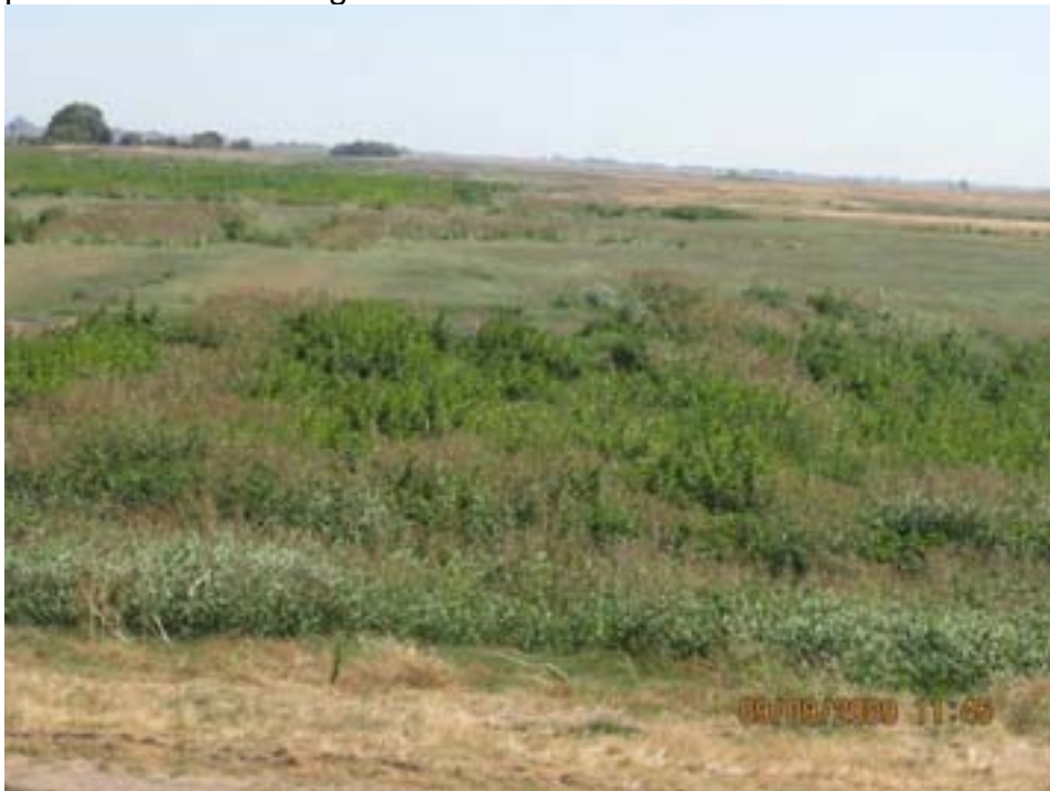
Field 99 looking east from levee.

There is considerable amount of Bermuda grass which hinders the discing activities. This poses a problem in the discing activities.