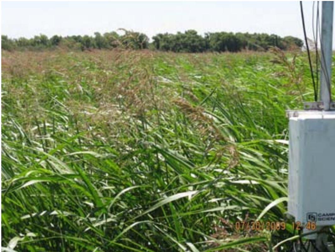
SR2 looking south 07/30/09

The roving SR station, SR2, is located in a field of Johnson grass. There is considerable growth of Johnson grass. The average height of the grass is 4 feet. Infill of open space has continued and canopy coverage is 90-100%. The station is to be moved on July 31 st .