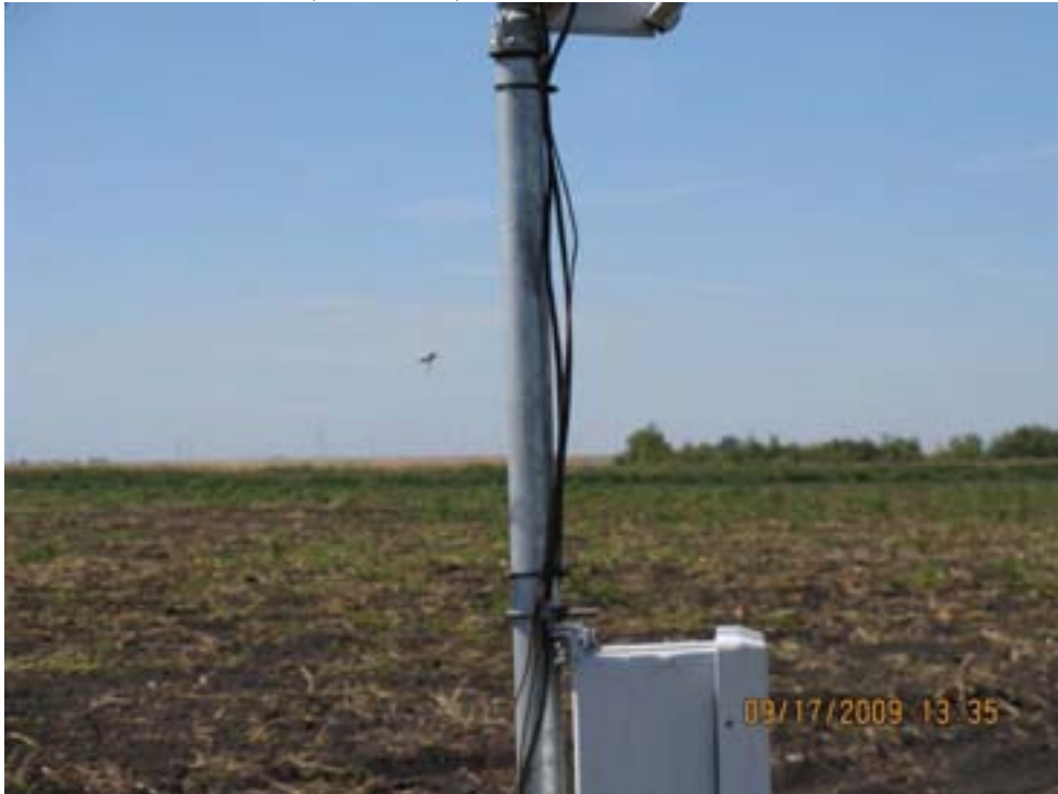
SR1 in field 23, looking west.

The location of SR1, Field 23, was disced last week.