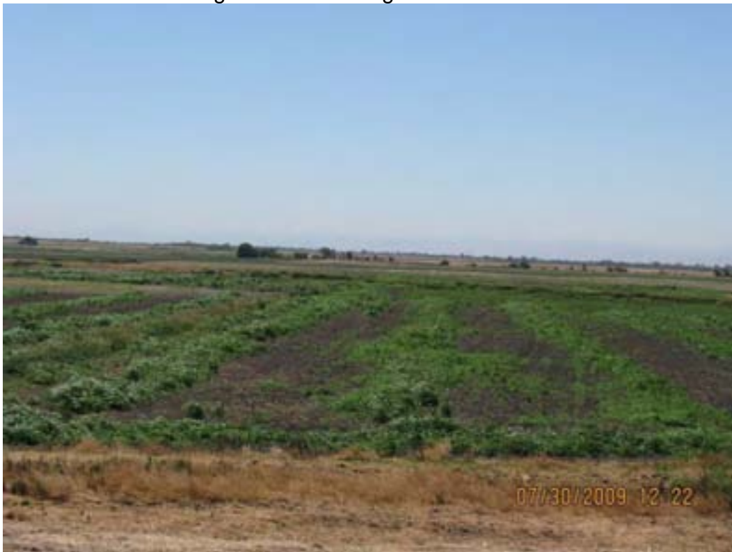
Field 5 designated as F-F, fallow field

The fallow fields show evidence of being disced but have considerable vegetation remaining. This field shows the discing but also has vegetation.