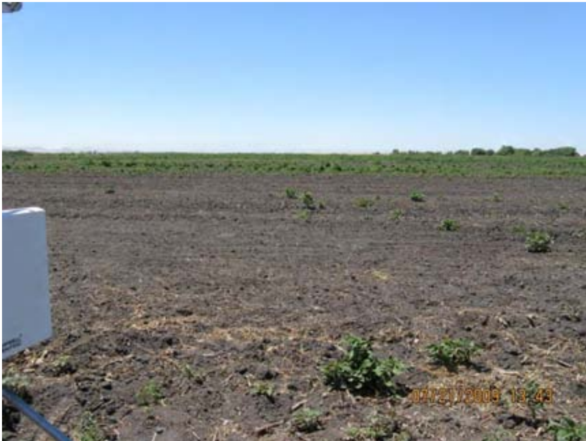
SR1 looking west 7/21/09

– The permanent SR station, SR1, is located in Field 23. The field continues to have slow growth of vegetation.