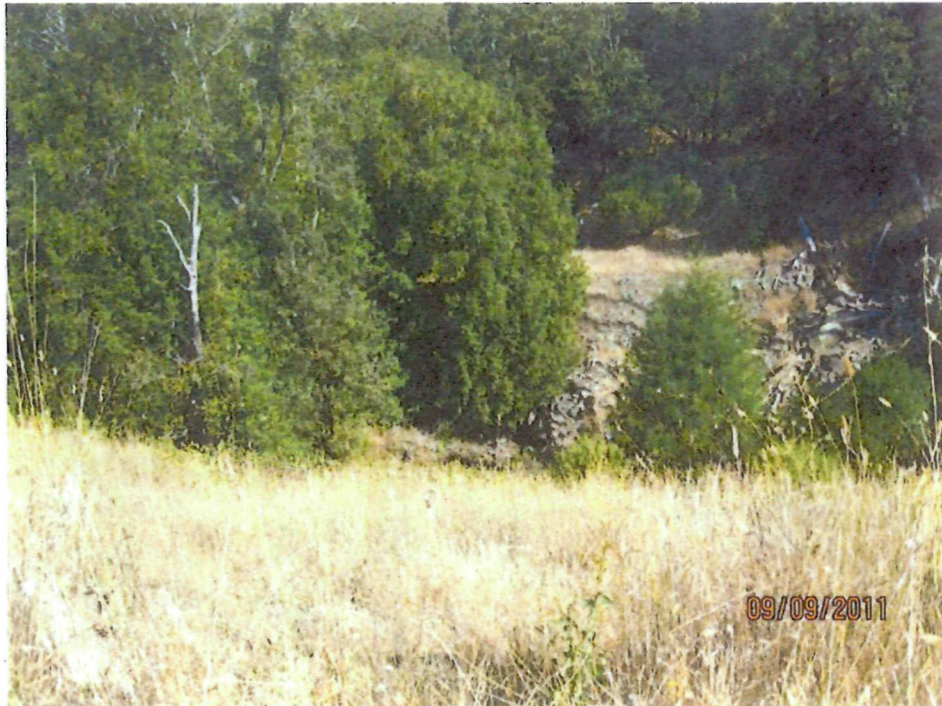
5. LOOKING NORTH OVER THE DAM AND DOWNSTREAM.