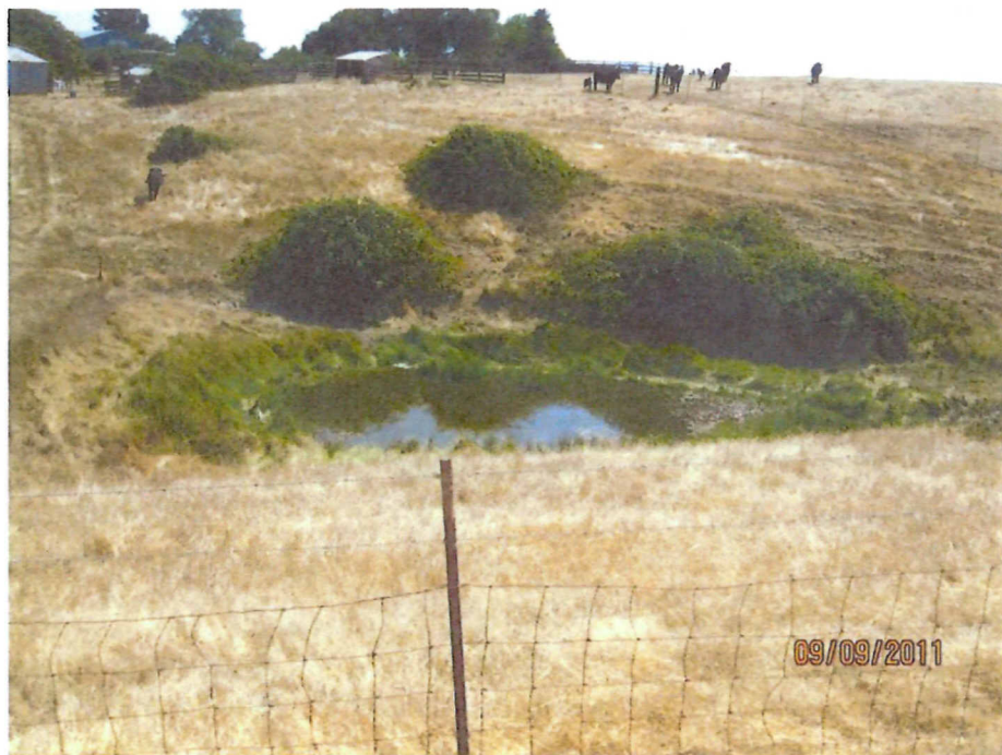
6. LOOKING EAST AT THE SPRING.