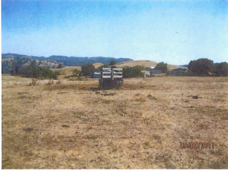
7. STOCK WATER TROUGH.