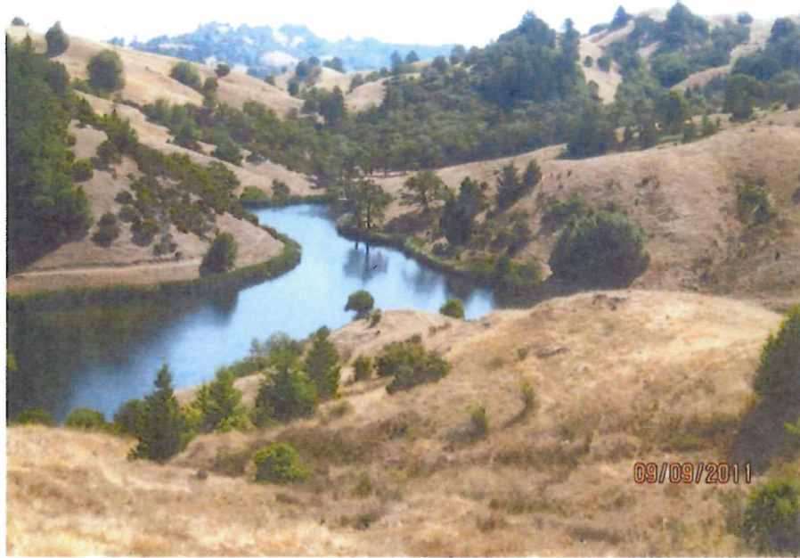
1. LOOKING SOUTHEAST OVER THE RESERVOIR.