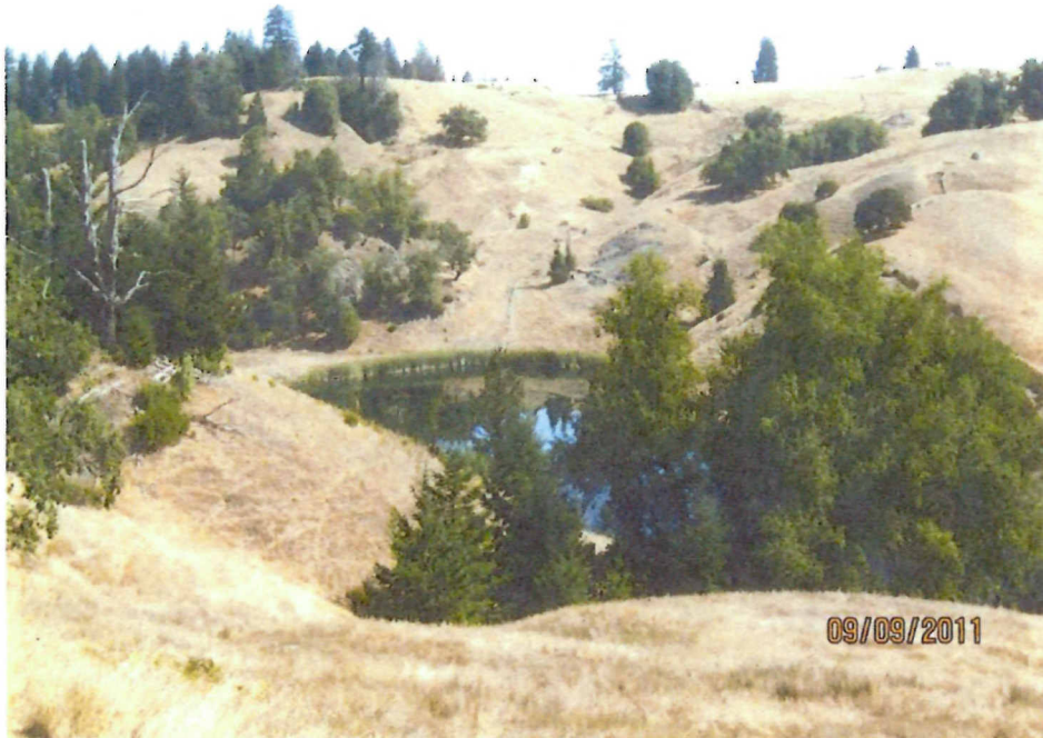
3. LOOKING NORTH TOWARDS THE DAM.