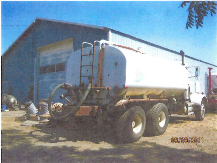
8. WATER TRUCK.