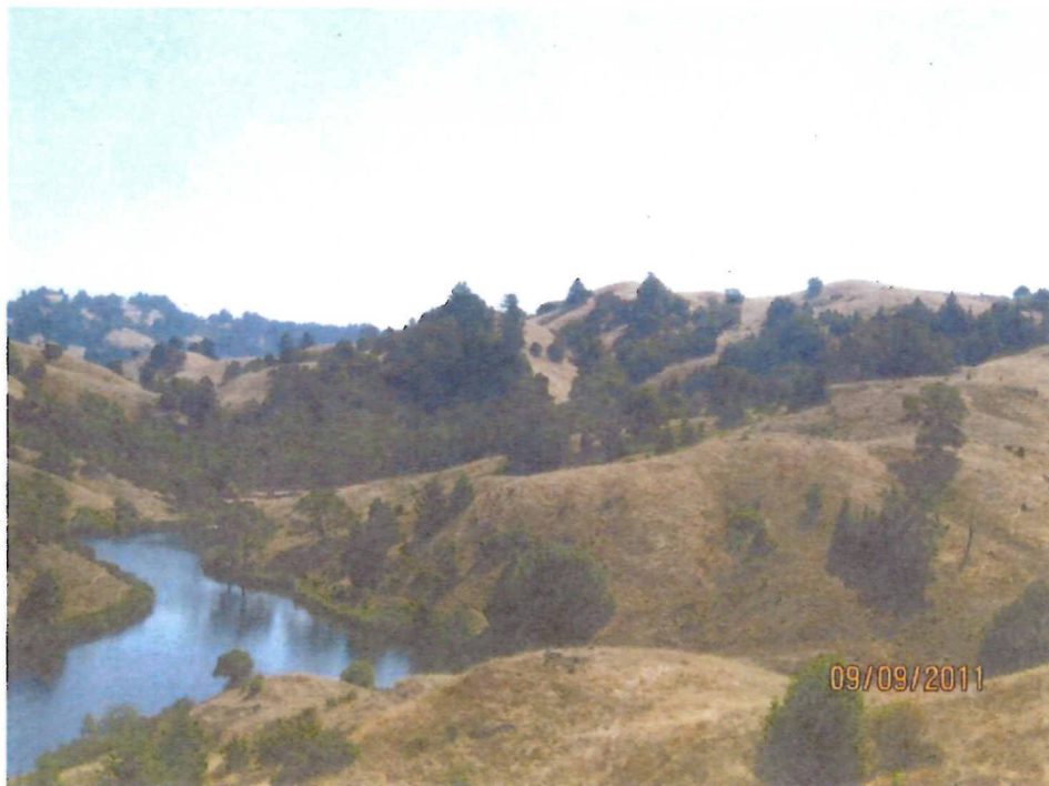
2. LOOKING SOUTHEAST AT THE PORTIONS OF THE WATERSHED.