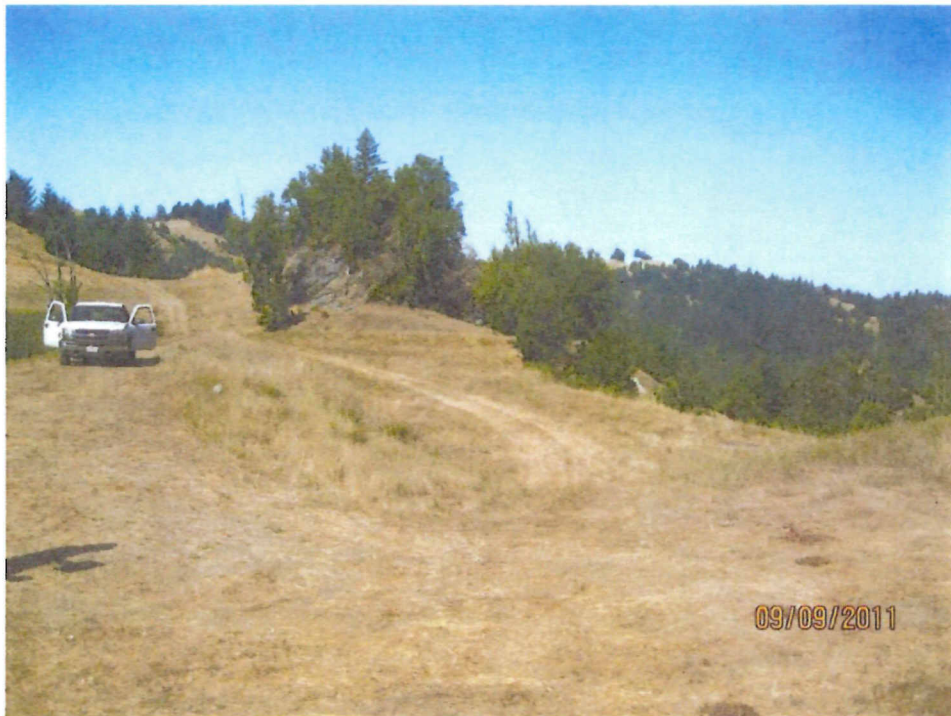
4. LOOKING WEST AT THE DAM.