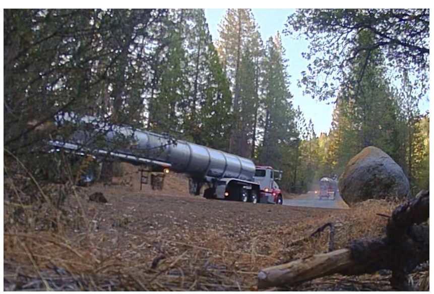
Still frame images pulled from "Rock cam" – exhibit ?