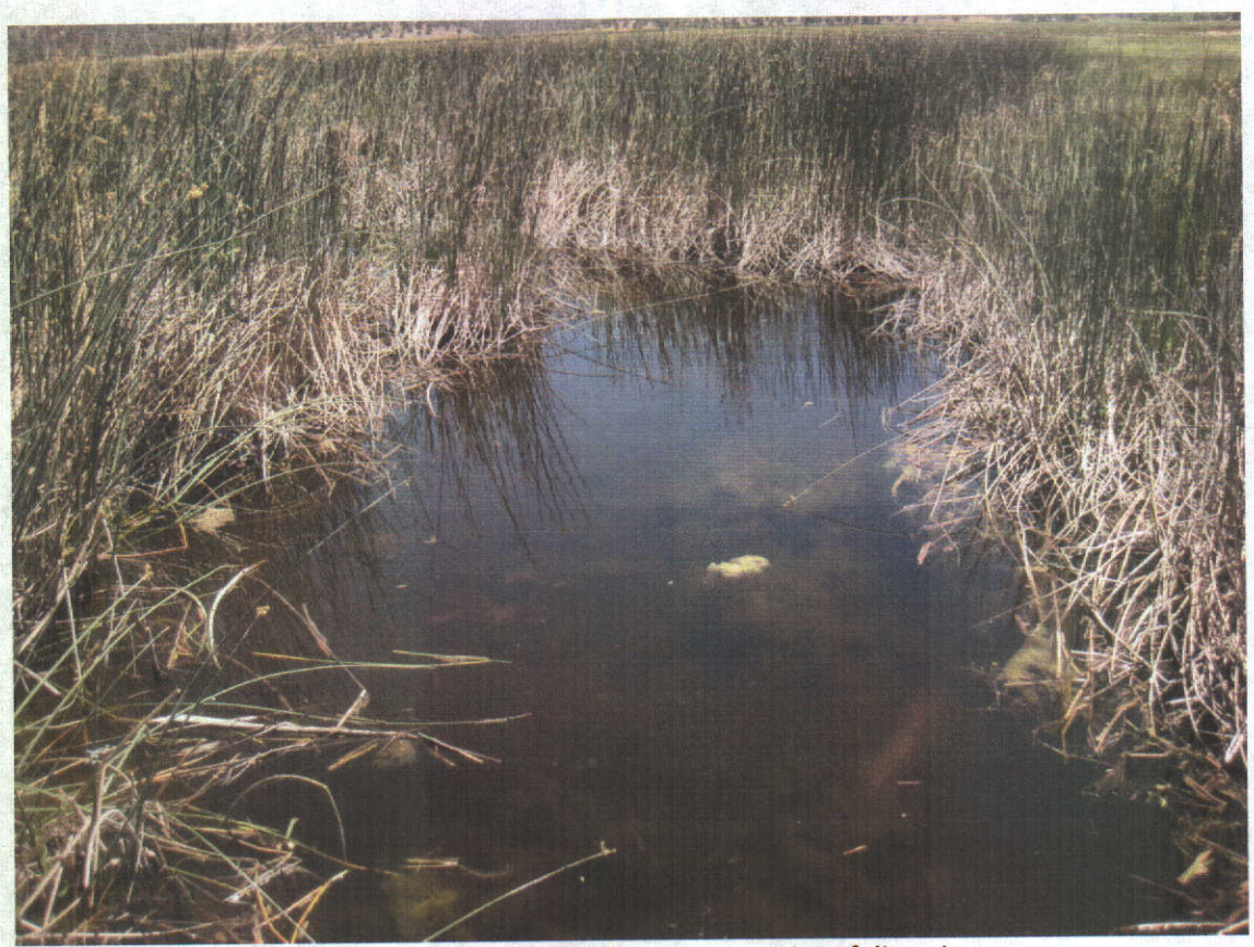
Photo 1: Diversion #246 Looking immediately upstream at point of diversion. Date Taken: 6/19/2012

Photos for Environmental Information Form, Question #7. Environmental Setting