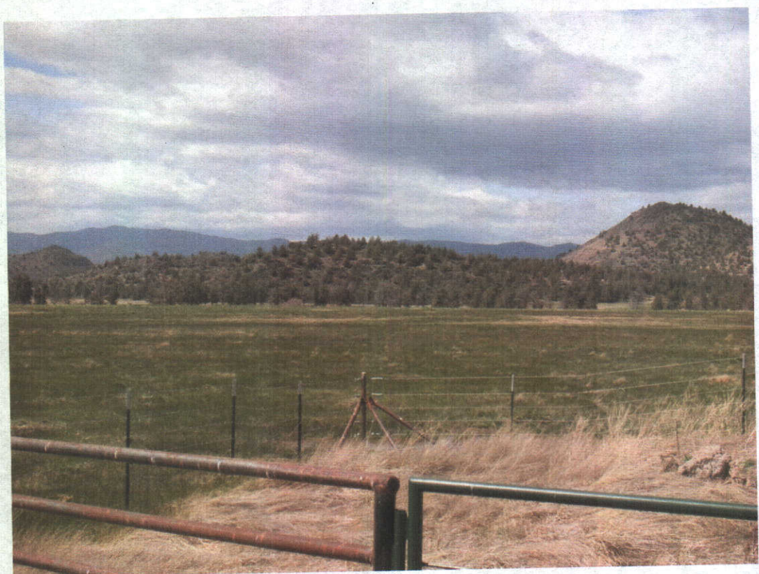
Photo 3: Diversion #246 place of use (irrigation). Date Taken: 4/20/2012

Photos to Accompany the Petition for Change Instream Flow Dedication (Water Code 1707) For Water Rights within the Shasta River Adjudication and Decree 7035, 1932