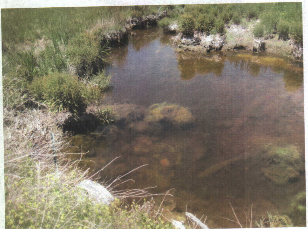
Photo 2: Diversion #246 Looking immediately downstream into Little Springs Creek. Date Taken: 6/19/2012