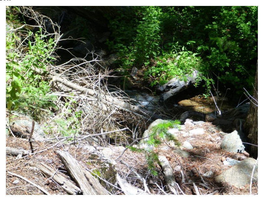
Figure 2. Cody Creek just upstream of diversion point. (June 28. 2013)