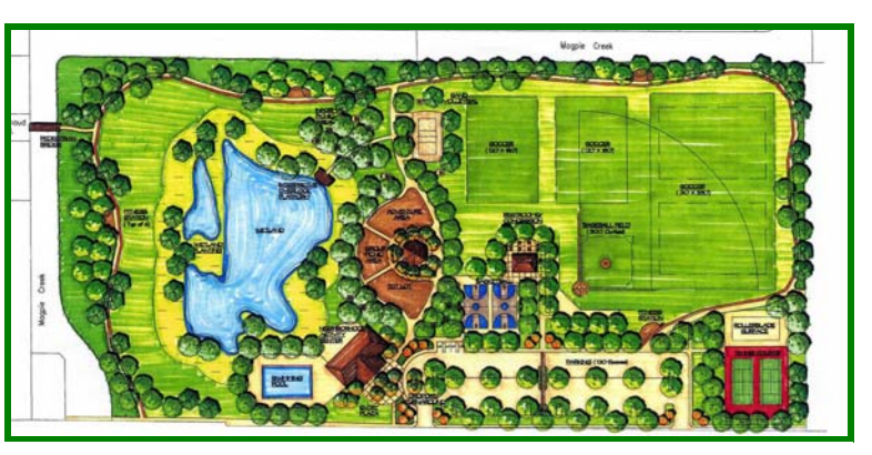
The Robla Community Park – Master Plan

Hundreds of people had stopped by, visited for a while, validated our efforts, and learned more themselves. Others in