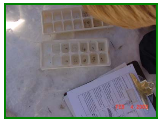
Sorting macro invertebrates from the Upper Truckee River

Meyers Elementary School is situated at the southern end of the Lake Tahoe watershed approximately one half mile from the Upper Truckee River, which supplies 40% of the water flowing into Lake Tahoe. It is surrounded by a mix of forests, meadows, and residential