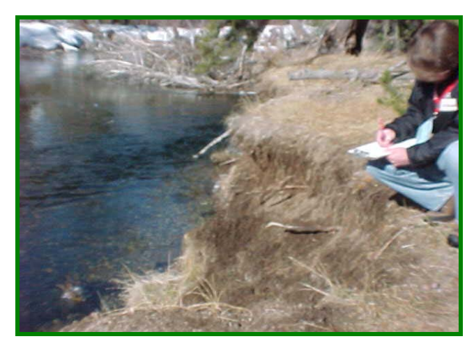
Making a visual assessment of one reach of the Upper Truckee

class that the word needed to get out to citizens of, and visitors to, the Lake Tahoe Basin. Their solution was to create public service advertisements and a web site defining the problem of Lake Tahoe's declining clarity while giving simple remedies. But that didn't satisfy