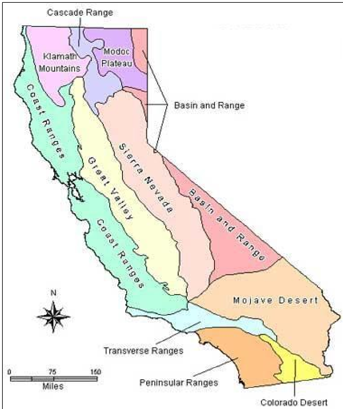
Figure 1 — California Geomorphic Provinces

Alternatively, the Permittee may use a geomorphically based hydromodification standard or set of standards and analysis procedures designed to ensure that Regulated Projects do not cause a decrease in lateral (bank) and vertical (channel bed) stability in receiving stream channels. The alternative hydromodification standard or set of standards and analysis procedures must be reviewed and approved by the Regional Board Executive Officer.