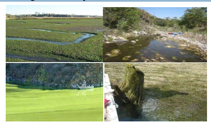
Dissolved Oxygen, pH