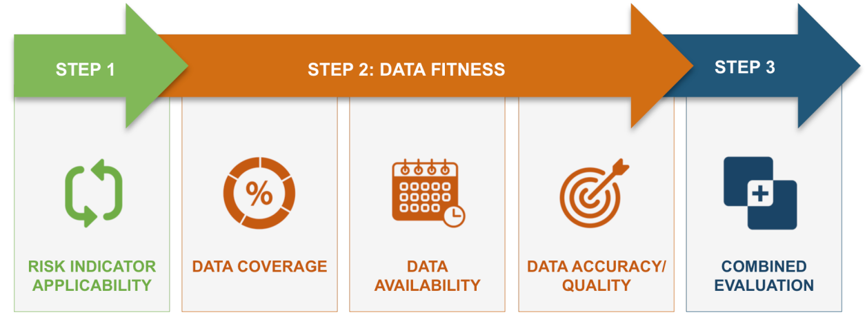
Figure 3: Risk Indicator Evaluation Tool

The Evaluation Tool consists of three steps and utilizes a combination of qualitative and quantitative criteria to evaluate risk indicators: